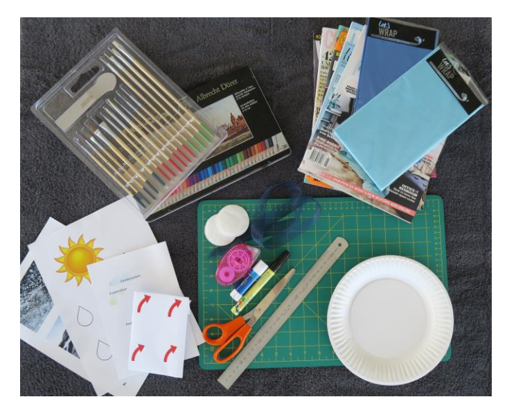
Figure 1: Collage materials

Did you know that the water cycle goes round and round?