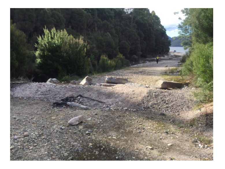
Crotty Smelter: Blocked access road

The old road to the North Mt Lyell Smelter that was submerged under the lake when Crotty Dam was built has been blocked off via the development of a trench and rock barrier. Vehicular access is now prohibited to the Crotty Smelter site and signage has been erected to advise visitors of the closure to conserve the cultural heritage values of the area and ensure public safety.