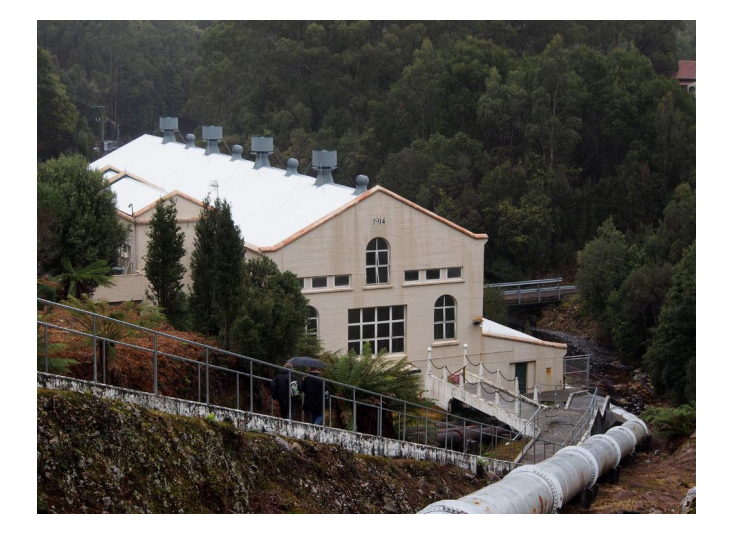
Protection of heritage assets: Lake Margaret Power Station

We are committed to the establishment, strengthening and maintenance of our relationships with stakeholders, and to the transparent communication of our operations and impacts in the area. We will continue to work with stakeholders to identify opportunities to work together.