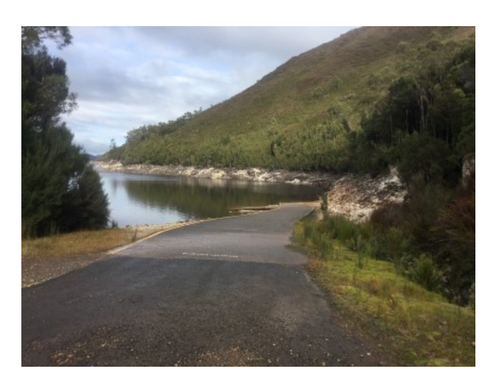
Lake Burbury: Thureau Hills boat ramp