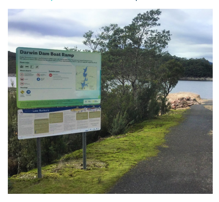
Darwin Dam boat ramp: New signage installed

New signage has also been installed at these sites. Signage upgrades are part of a state-wide initiative that we are undertaking in all of our catchments. All other recreational areas managed by us in the King and Yolande catchments will receive upgraded signage and ongoing management of the signs.